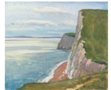
56. Afternoon Sun, Bat's Head Oil on canvas 12 x 14 inches

Upon receipt of this catalogue all works are available for sale The entire exhibition can be viewed at www.charleschurch.net