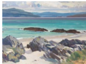
54. Pulpit Rock, Green Sea Iona Oil on canvas 12 x 16 inches