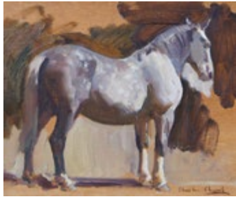
22. Pecheron Stallion Study Oil on panel 10 x 12 inches