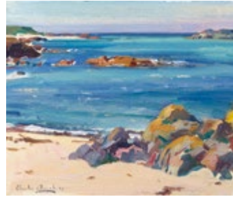
44. Bright Day, North Beach Iona Oil on canvas 10 x 12 inches