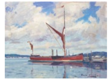
36. Thames Barge, Pin Mill Oil on canvas 12 x 16 inches