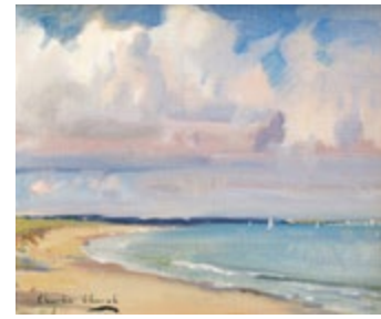
30. Studland Beach Oil on canvas laid on board 9 x 11 inches