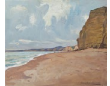
46. Burton Bradstock Oil on canvas 12 x 14 inches