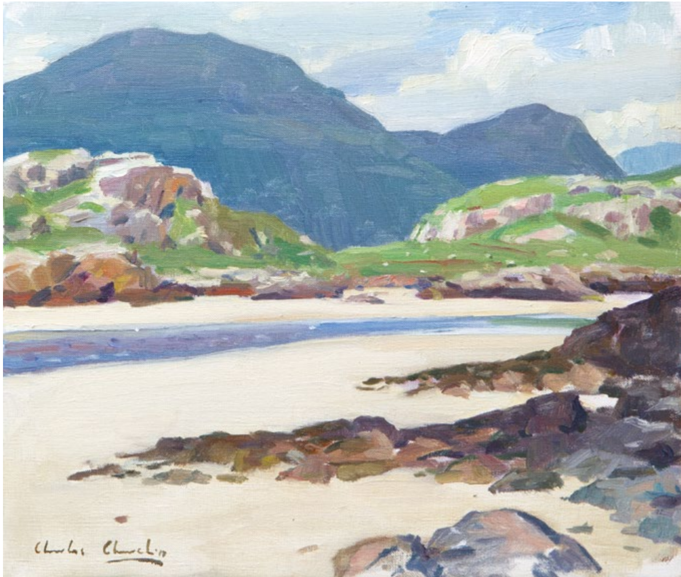
9 Inlet at Lettergesh, Connemara Oil on canvas 12 x 14 inches