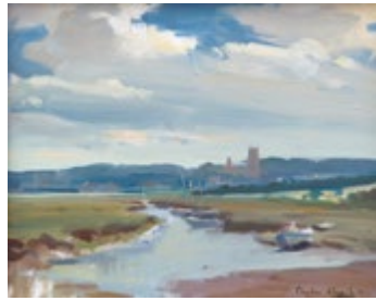
23. Blakeney from Morston Oil on canvas 12 x 15 inches