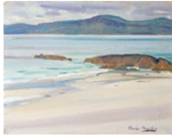
48. Pale Light, North End Iona Oil on canvas 12 x 15 inches