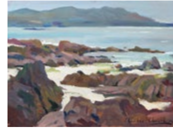
45. Misty Day, North Beach Iona Oil on panel 8 x 10 inches