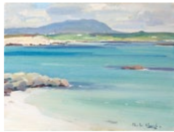
33. Pale Sea, Mannin Connemara Oil on canvas 12 x 16 inches