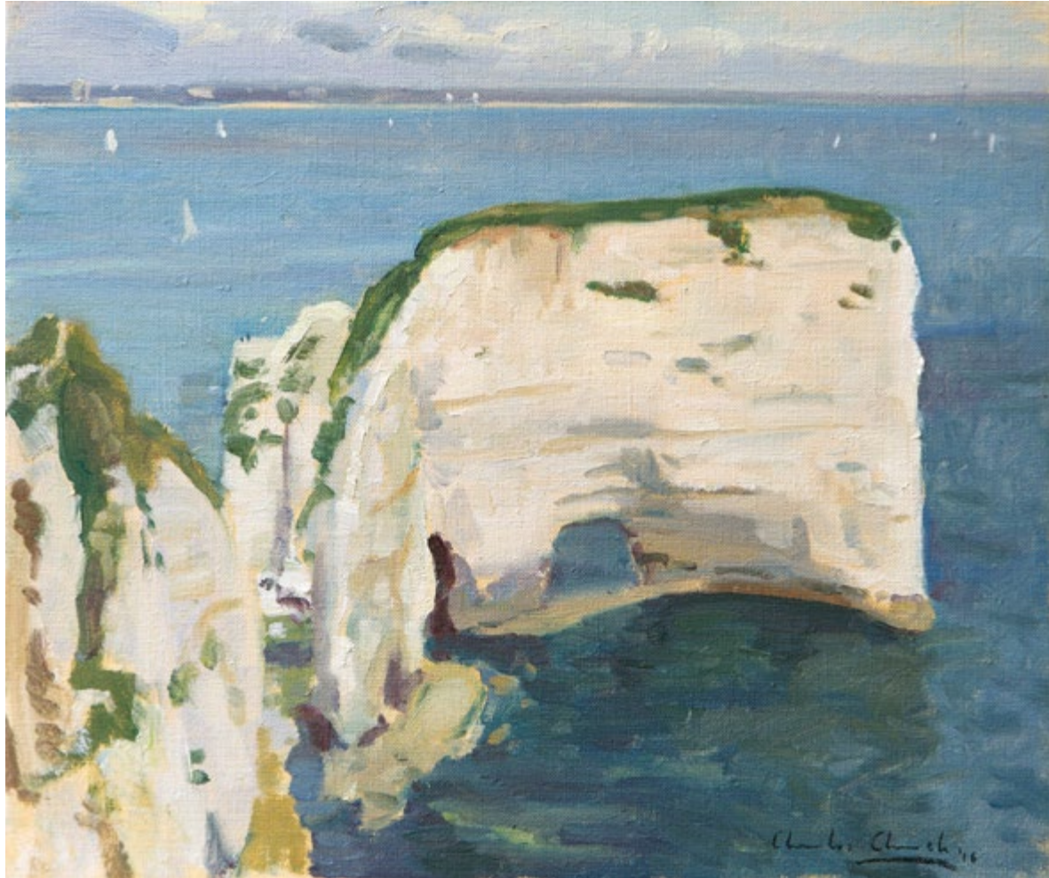
16 Old Harry Rocks Oil on canvas 12 x 14 inches