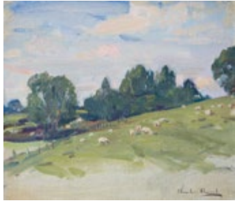
42. View from the Studio Oil on canvas 12 x 14 inches