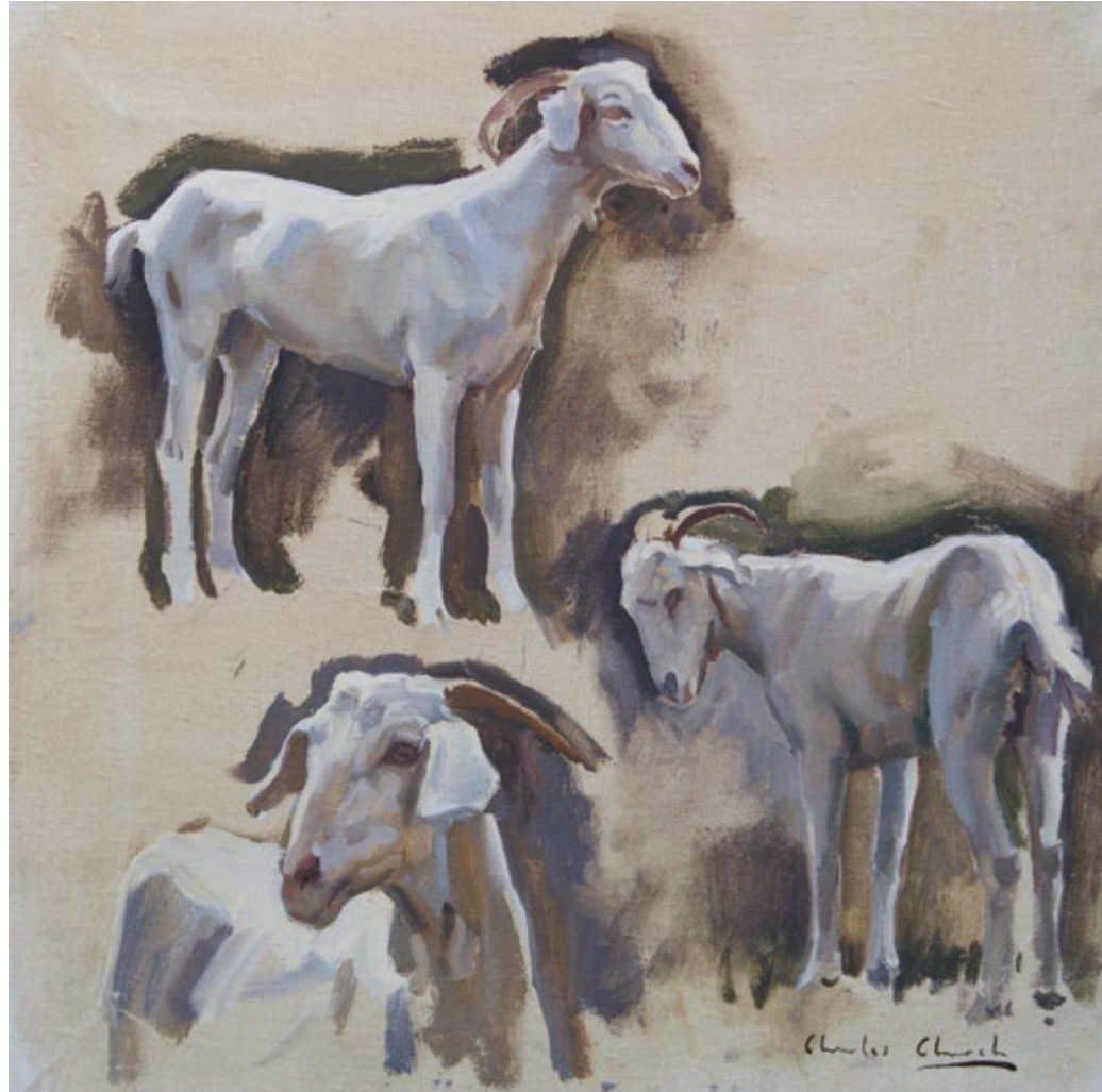
11 Studies of a Goat Oil on canvas 14 x 14 inches