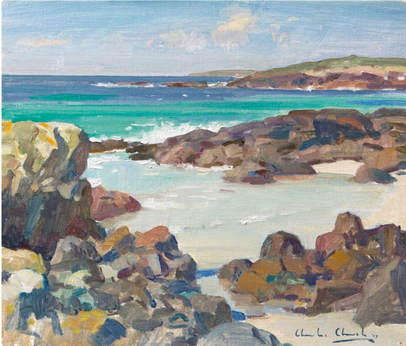
10 Rocks at Doonloughan, Connemara Oil on canvas 12 x 14 inches