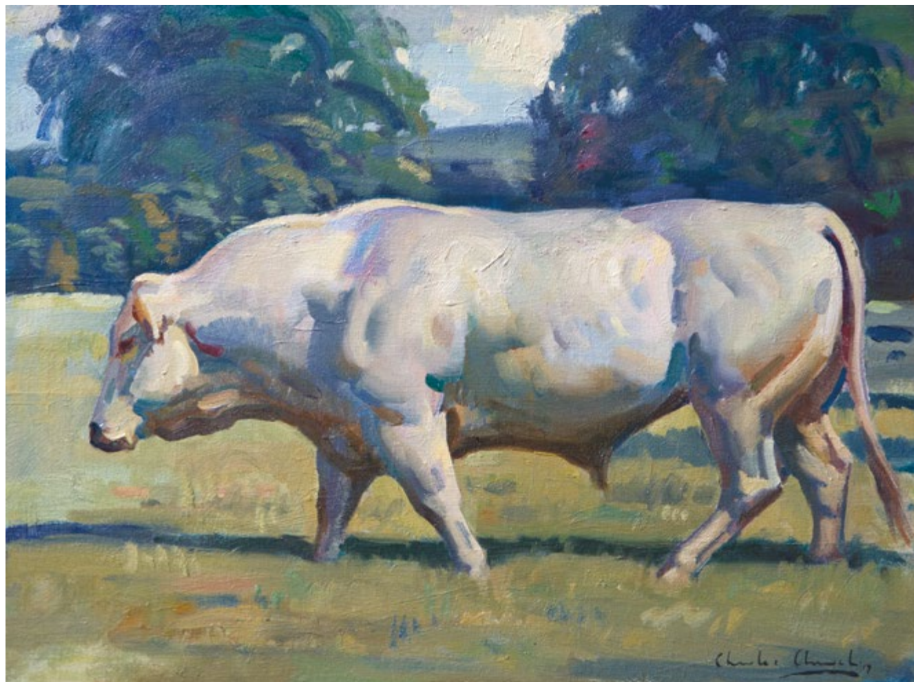
17 Charolais Bull, Walking Oil on canvas 12 x 16 inches