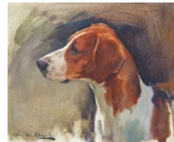
55. Belvoir Hound Head Study Oil on canvas 10 x 12 inches