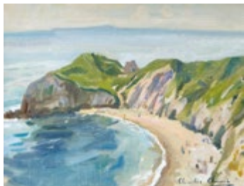
32. Man O'War Bay Oil on canvas laid on board 8 x 10 inches