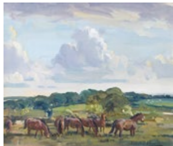
53. Exmoor Ponies, Spring Oil on canvas 12 x 14 inches