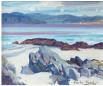
27. Pulpit Rock, Iona Oil on canvas 10 x 12 inches