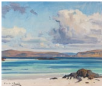
52. Cumulus, White Strand Iona Oil on canvas 12 x 14 inches