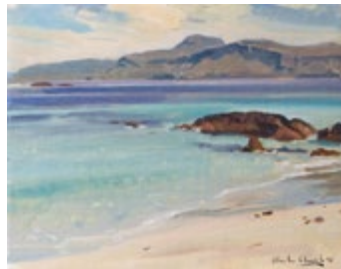
29. Green Sea, Iona Oil on canvas 12 x 15 inches