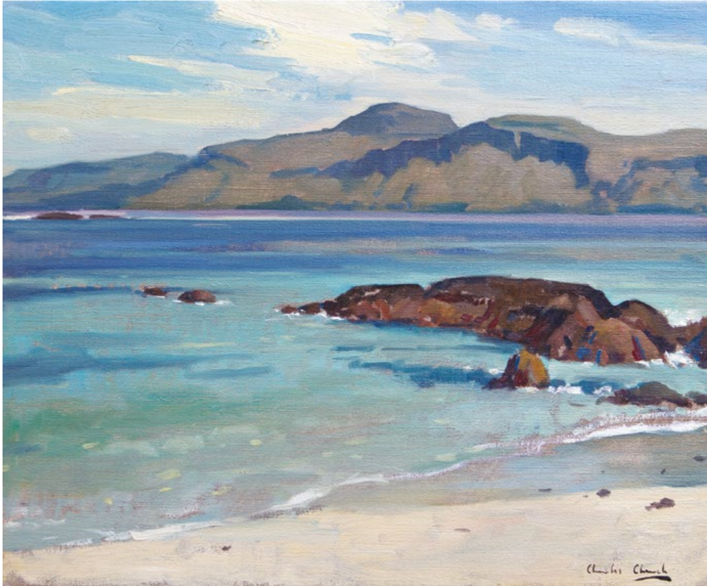
14 North End, Iona Oil on canvas 20 x 24 inches