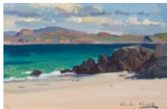
39. Evening light, Cows Rock Iona Oil on panel 8 x 12 inches