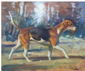
37. Walking Hound Study Oil on panel 10 x 12 inches