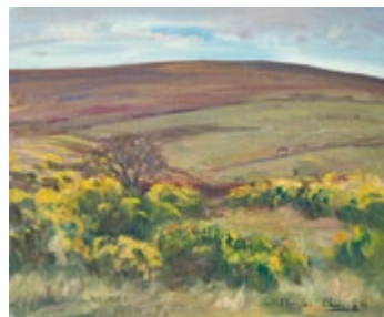
38. Gorse on Exmoor Oil on canvas 10 x 12 inches