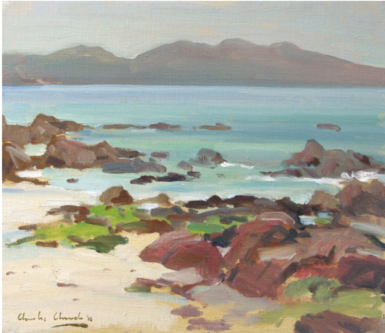
19 Sea Mist, North Beach Iona Oil on canvas 12 x 14 inches