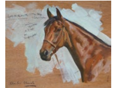
51. Head Study of Goldikova Oil on Panel 10 x 12 inches