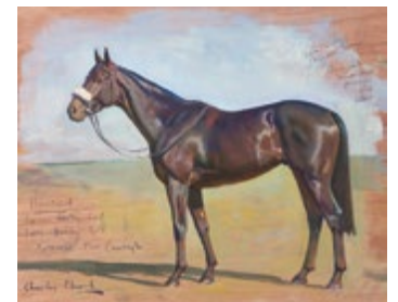
41. Study of Harzard Oil on panel 11 x 14 inches