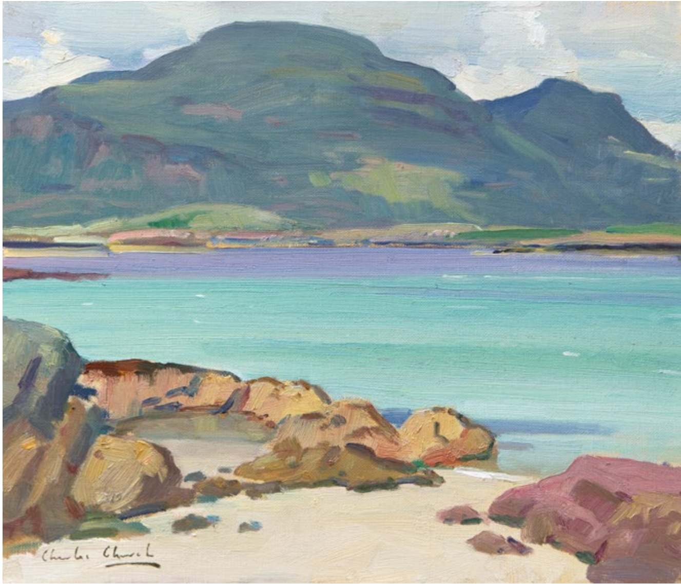
20 Glasslaun, Connemara Oil on canvas 12 x 14 inches