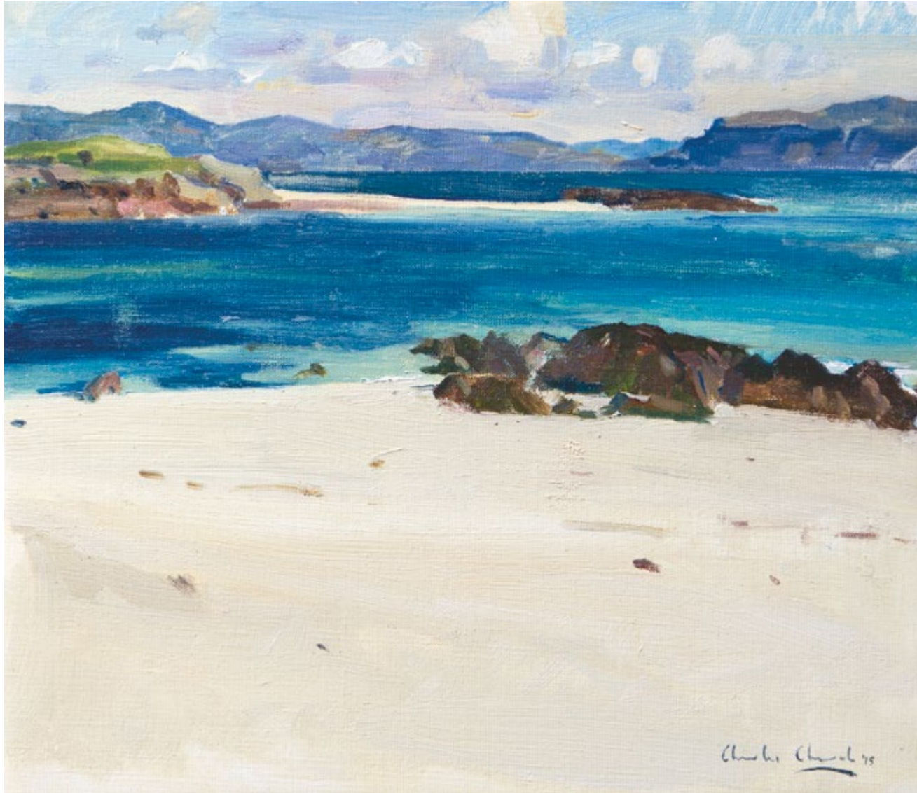
5 Blue Seas, Iona Oil on canvas 12 x 15 inches