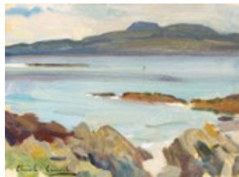
34. North End Iona Study Oil on panel 7 x 9 inches