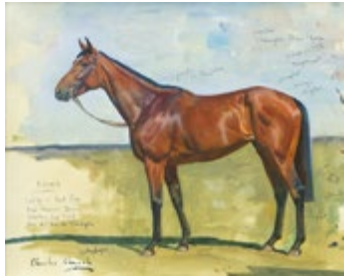
47. Study of Found Oil on paper 12 x 14.5 inches