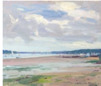
49. The Orwell Estuary Oil on canvas 12 x 14 inches