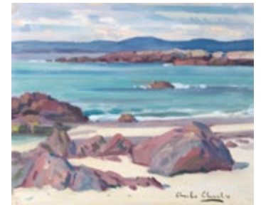
31. Pink Rocks, North Beach Iona Oil on canvas 10 x 12 inches