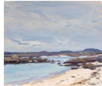
25. North Coast, Iona Oil on canvas 12 x 14 inches