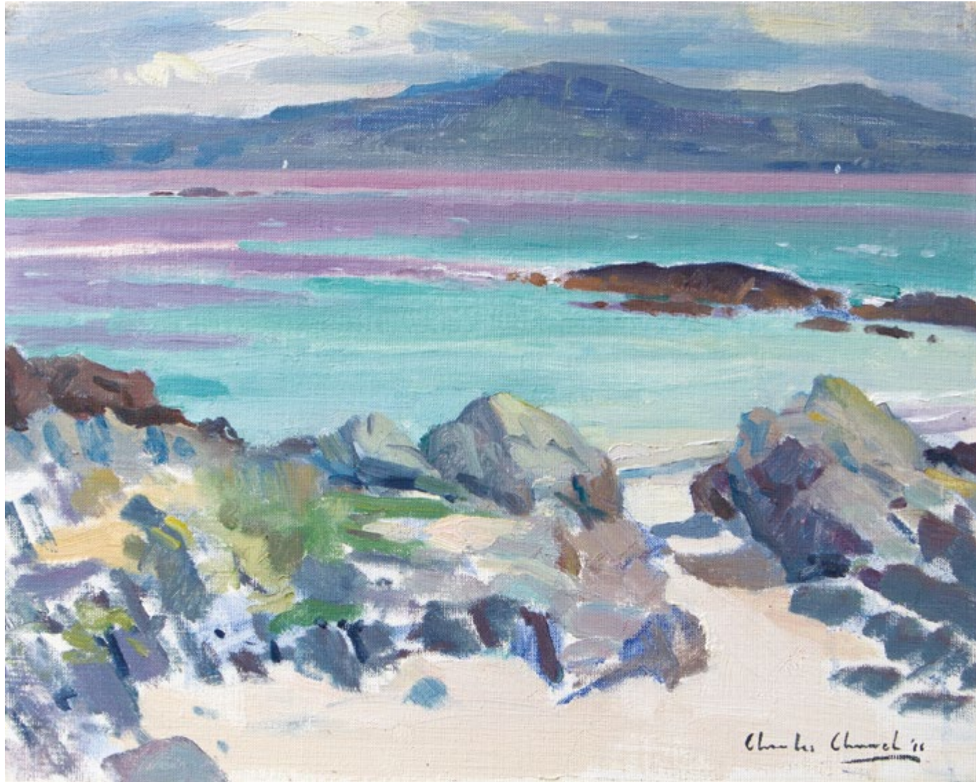
6 Purple Light, North End Iona Oil on canvas 12 x 15 inches