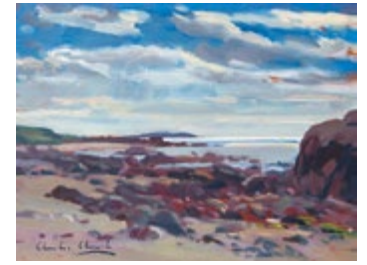
26. Sunset, North Beach Iona Oil on panel 8 x 10 inches