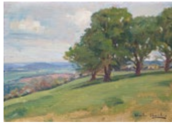
24. Holm Oaks, Bulbarrow Oil on canvas 10 x 14 inches