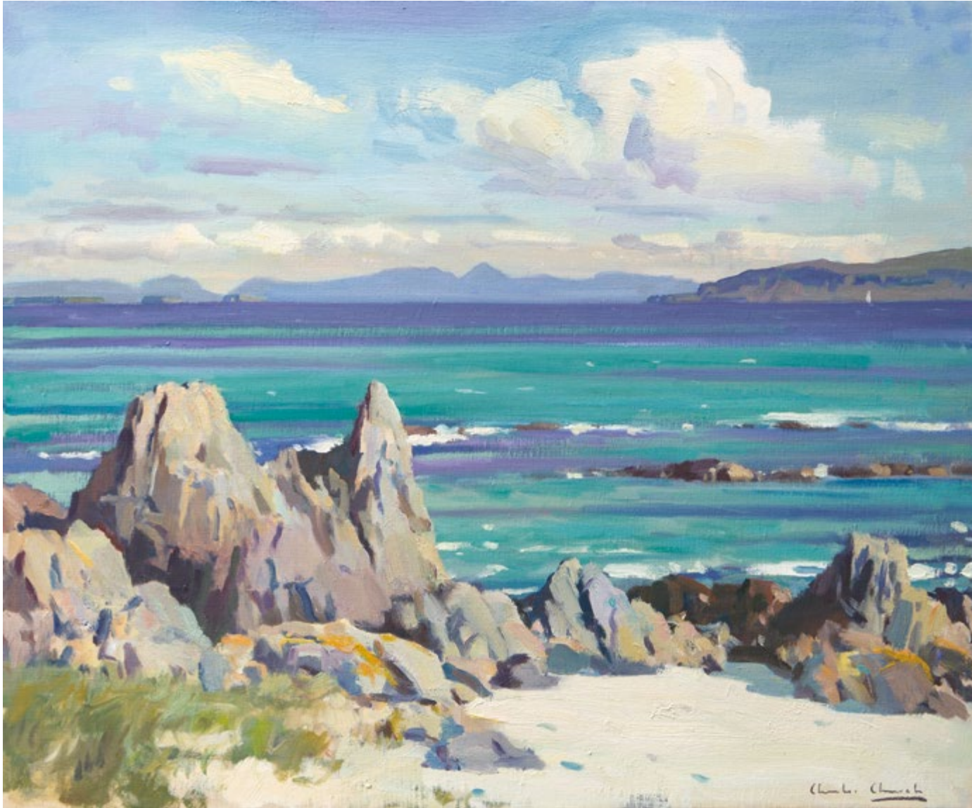
13 Cathedral Rock, Iona Oil on canvas 20 x 24 inches