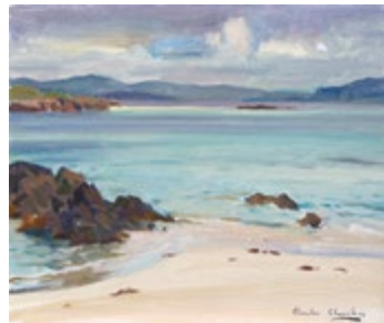
28. Lapping Sea, Iona Oil on canvas 12 x 14 inches