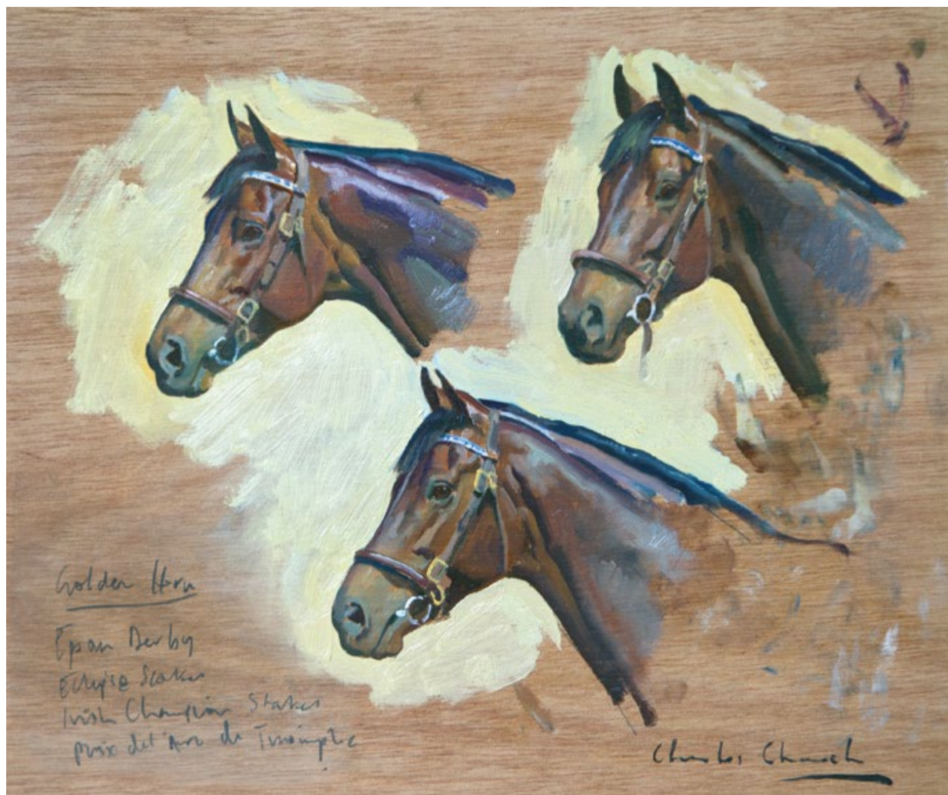
12 Head Studies of Golden Horn Oil on panel 10 x 12 inches