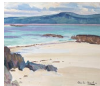
40. Low Tide, North End Iona Oil on canvas 12 x 14 inches