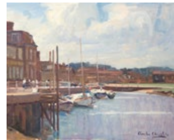
35. Blakeney Quay Oil on canvas 12 x 15 inches