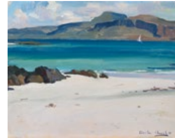
50. Ben Mor from Iona II Oil on canvas 12 x 14 inches