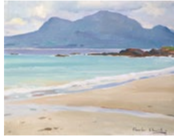
43. Renvyle Beach, Connemara Oil on canvas 12 x 15 inches